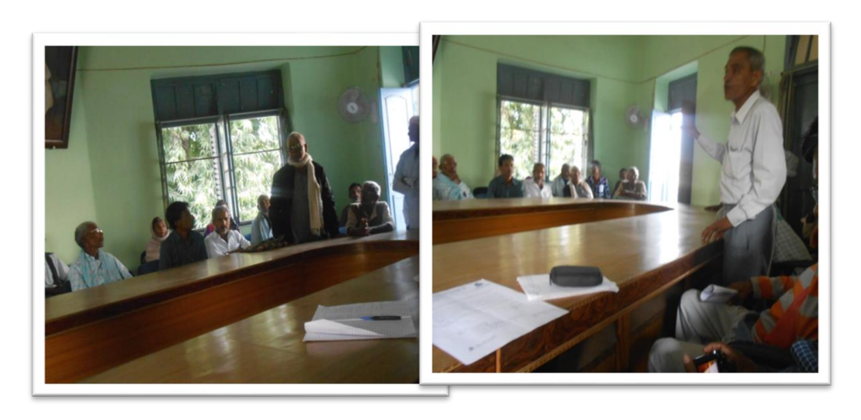
PCM in progress - Munger Nagar Nigam

meeting were also photographed. Minutes of the meeting are annexed with this report.